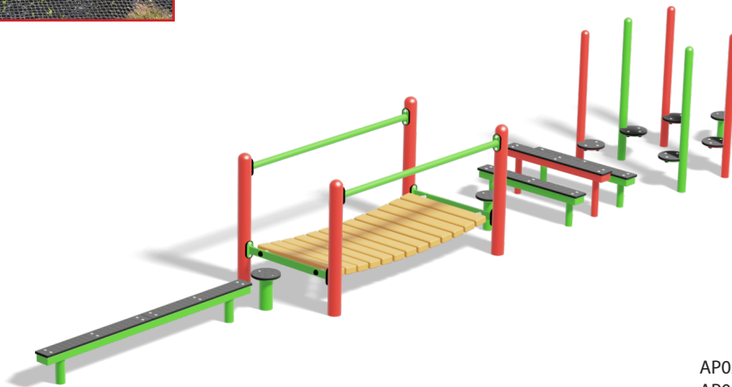
AP0203 Stepping Stilts AP0202 Hurdles AP0213 Clatter Bridge AP0207 Balance Beam L AP0212 Stepping Stump x 3